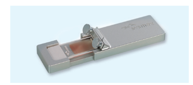
Fig. 2 The Sysmex HemoSlider

This is a small, portable, solidly constructed, standardised wedge smear maker. It is easy to use and clean and has replaceable spreader blades. A small drop of blood is placed on the one end of the slide, and the spreader pulled across. The result is a well-made smear of consistent quality with an even spread of cells.