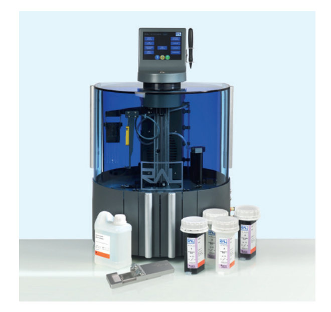
Fig. 3 The RAL Stainer

The RAL Stainer is an easy to use automated staining unit. The reagents are provided in closed cartridges which have RFID tags which prevent reagent usage beyond expiry as well as over usage, a common problem with other non-closed methods. The staining protocols have been optimised for peripheral blood smears made using the HemoSlider. All sources of error mentioned above can be completely eliminated using the HemoSlider RAL combination. The analyser allows for continuous loading and unloading with the ability to insert an urgent slide at any time. A major advantage is that no maintenance is required and from a safety and environmental perspective, the stains are methanol free.