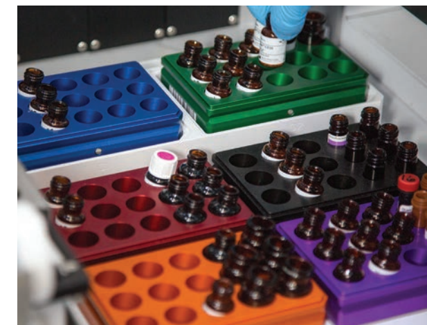
PS-10 reagent blocks hold up to 90 antibody reagent vials of different sizes

We are continuously expanding our CE IVD antibody portfolio to cover the needs for all important panels. Visit our shop to see the current list: www.sysmex-flowcytometry.com