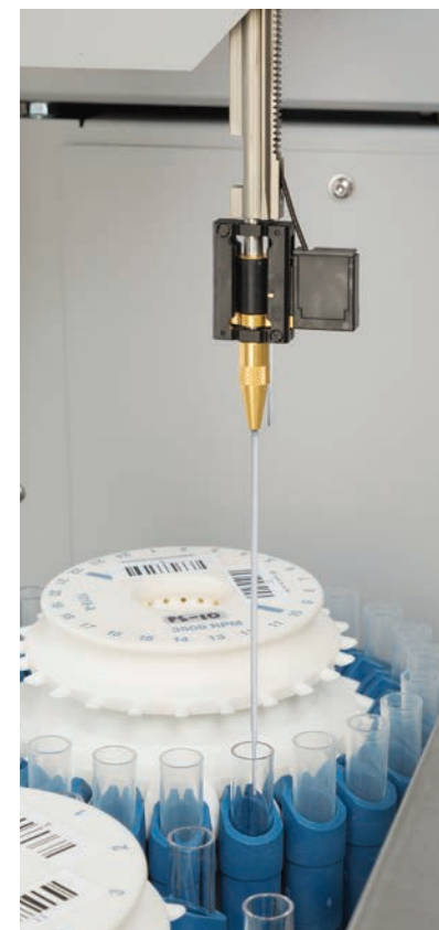
Dual pipetting probes for fast throughput