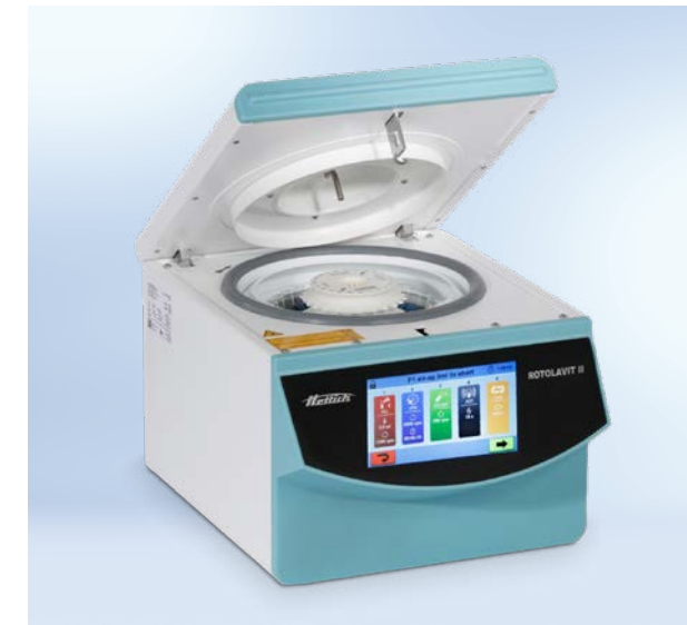
Hettich Rotolavit II-S automated cell washing system