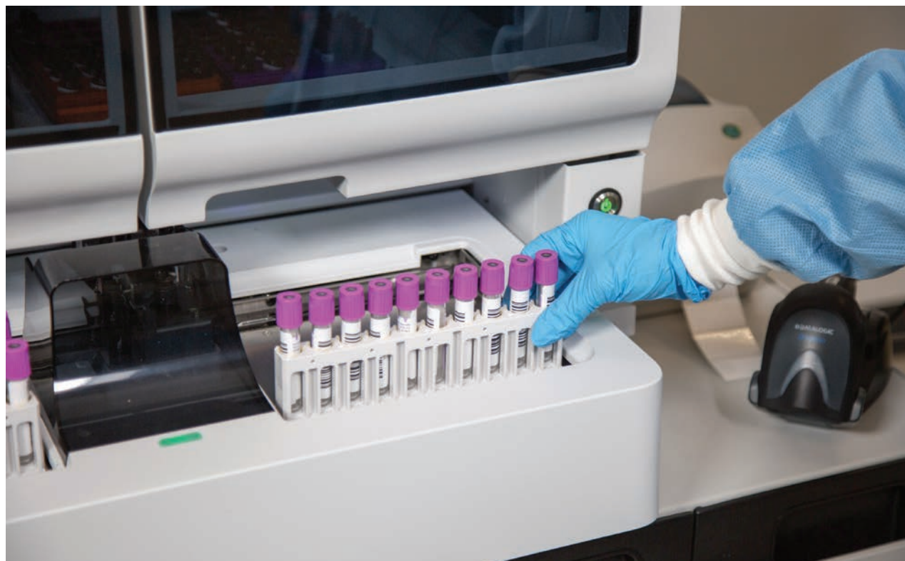
Loading the autosampler